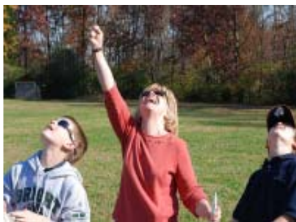
Rocket Launch 2009